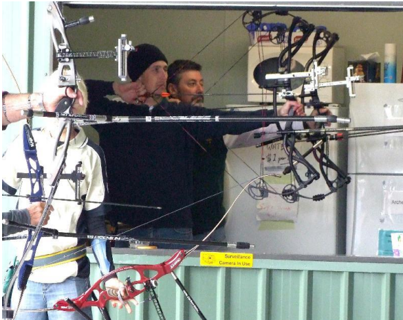
Do convoluted bows make twisted thinking?