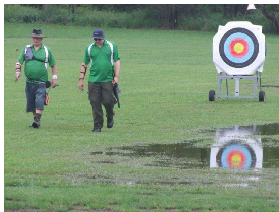
"Archers in a reflective mood"