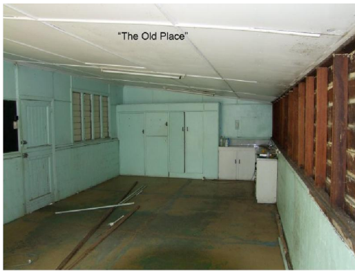
"The Old Place"