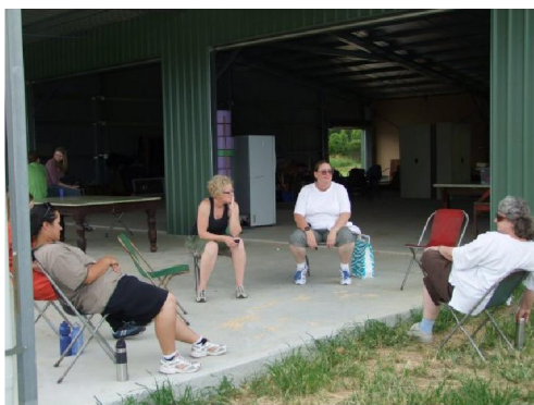
Relaxing at the end of the move.