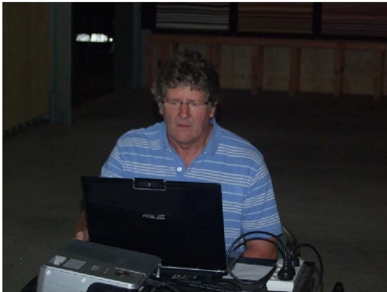
A worried man -

... but sometimes he just goes - BLUUUR!!