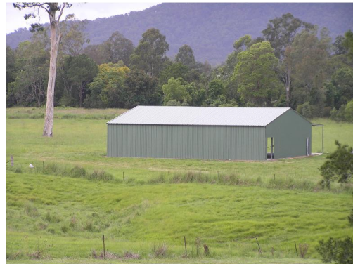
The "East Hall" - nearly.