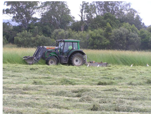
It was a jungle out there.