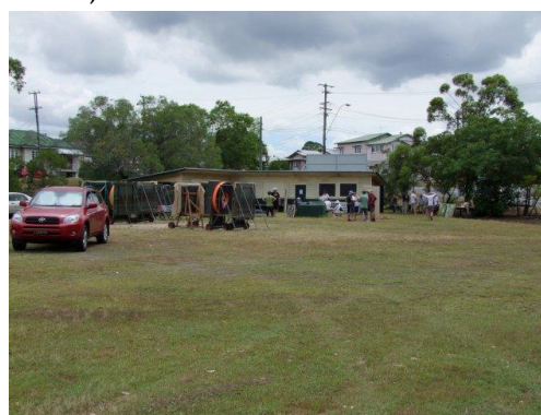
Emerson Park - moving day.

With a bit of prompting, Brian has come up with some photos which illustrate where we were, so you all can see how far we’ve come as a Club and a facility. (Actually the ones at the old Club are mine).