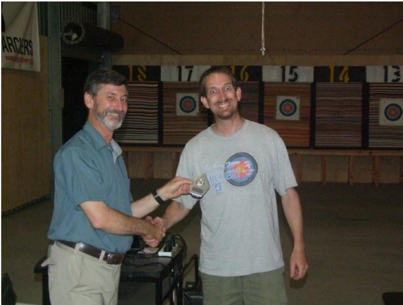
Silly grin - get's you in!

... but sometimes he just goes - BLUUUR!!