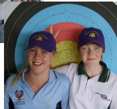
More of the winners (and place getters), and grinners.